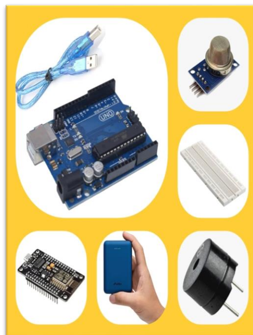
FIGURE 1:- ARDUINO UNO, MQ4 SENSOR, WIFI ESP8266 SENSOR, BUZZER, BREADBOARD, POWER SUPPLY, USB CABLE.

The Arduino can be powered via the USB connection or with an external power supply. External power can come either from an AC- to- DC adapter (wall-wart) or battery. The circuit operates on 5V DC. We can also provide power supply through laptop or PC connected through USB or through battery (as shown in FIG 1).